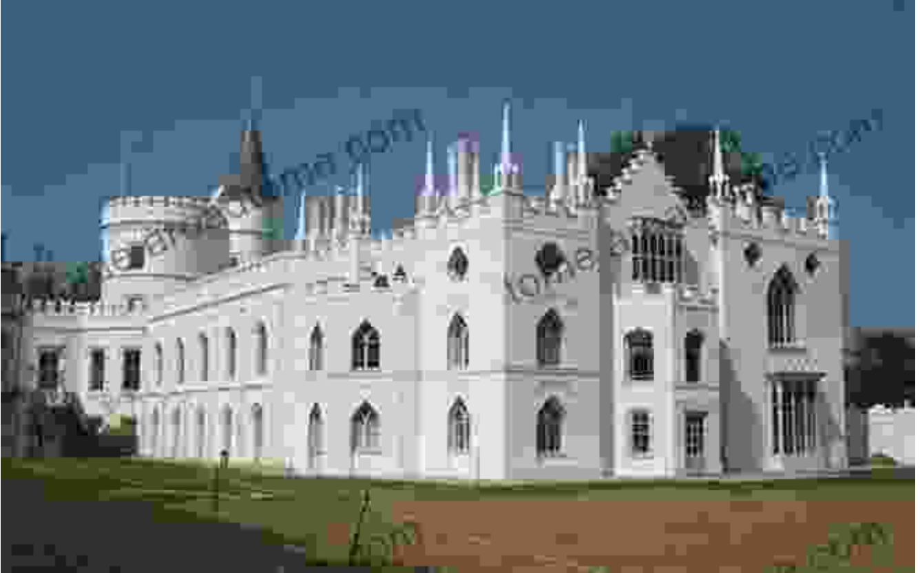
Strawberry Hill House in England, a prime example of Romantic architecture.