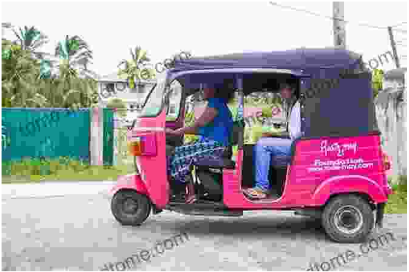
A tuk tuk driver chats with a passenger in Sri Lanka.