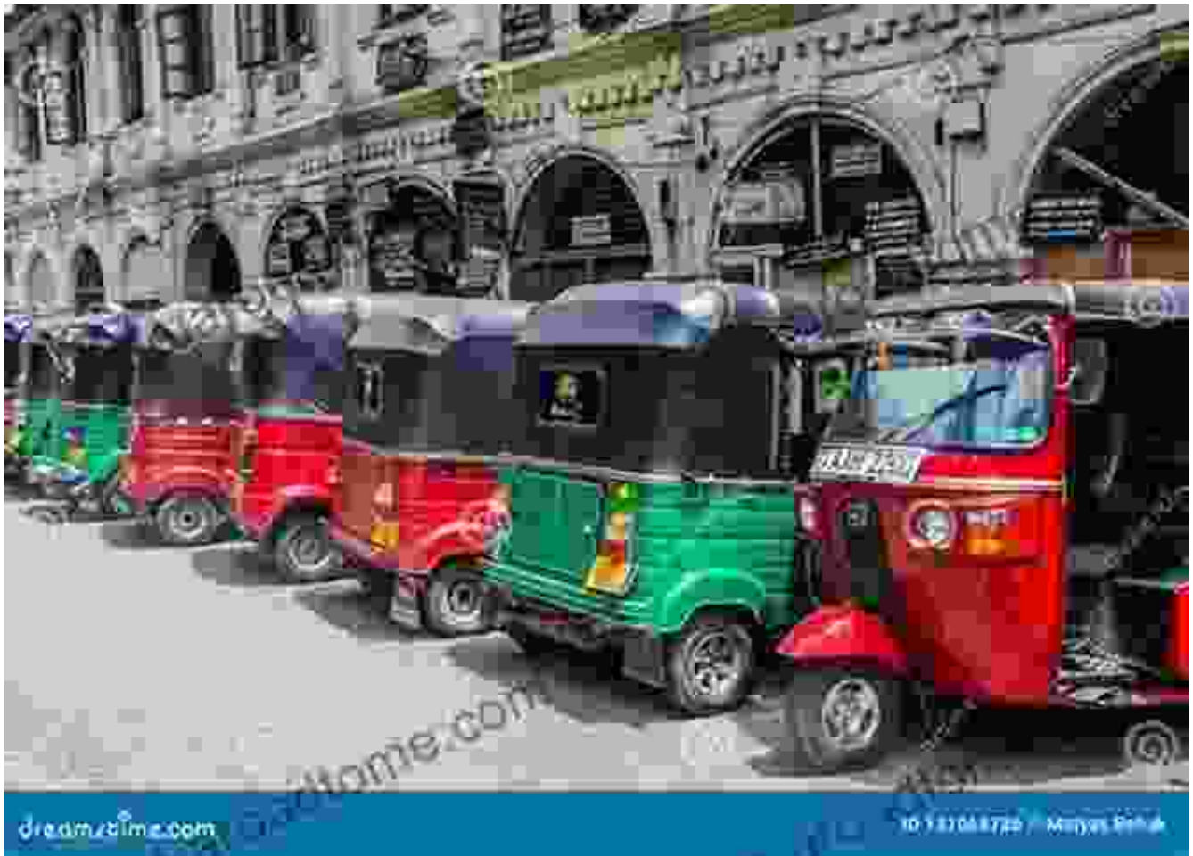
A group of tuk tuks parked on the side of the road in Sri Lanka.