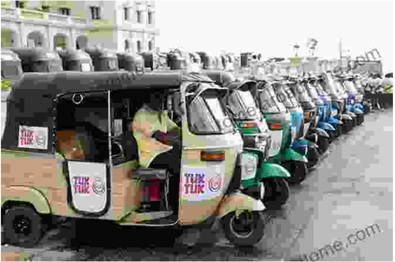
A tuk tuk driver navigates the busy streets of Sri Lanka.