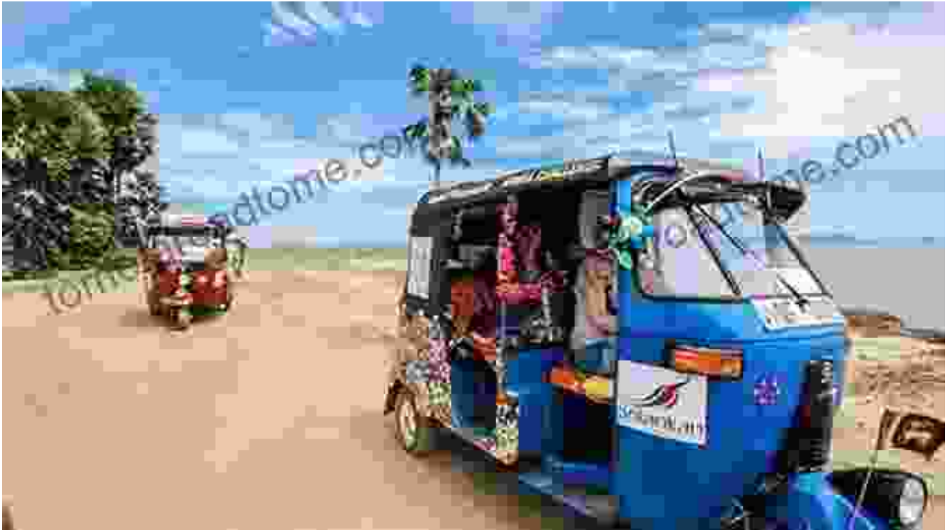
A colorful tuk tuk drives through the streets of Sri Lanka.